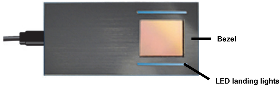
Figure 2 Landing lights and bezel on the Nomad 30 Pocket Reader