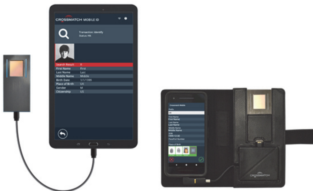
Figure 1 Examples of the Nomad 30 Pocket Reader connected to a tablet and connected to a smartphone in a folio.

Integration of the reader utilizes the Crossmatch U.are.U SDK.